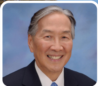
Howard K. Koh, MD, MPH

The 14th United States Asst. Secretary of Health and Human Services